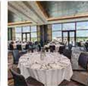
THE GARDEN SUITE