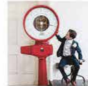
THE OLD WEIGHING ROOM

Whether you are looking for a romantic retreat for an intimate wedding with your nearest and dearest, or a magical celebration with hundreds of guests, the combination of the Old Weighing Room and the Hilton Garden Inn provides the perfect partnership.